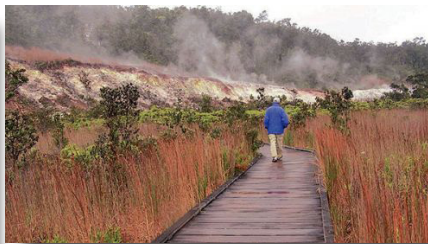
SULPHUR BANKS AND MORE