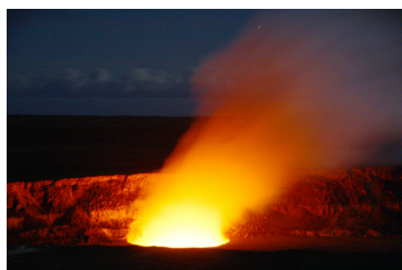
THE SUMMIT: SEEN & UNSEEN

The management of Volcano House Hotel and guests who have participated in the program have been highly pleased with the personalized tours offered. Guests have given donations to the Friends and some have gone on to book their own private institute-on-demand tours to further enhance their visit to Hawai'i Volcanoes National Park.