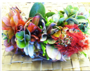
HAWAIIAN CULTURAL TOUR