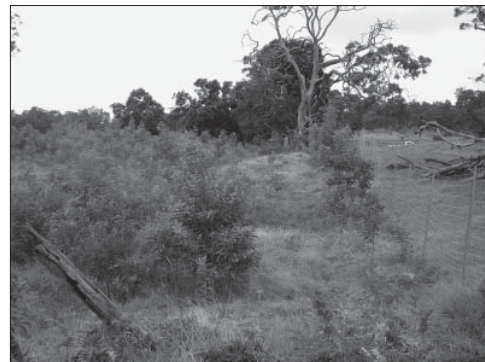
Koa recovery (left) takes place inside fenced enclosures at Kahuku

Based on relic tree stands and undisturbed forest vegetation in the bottom of pit craters, these forest remnants are comprised of a rich variety of species, including several that are rare and endangered. Native forest birds 'i'iwi, 'apapane, and 'amakihi are observed in forest remnants; and the forest adjoining the cattle pasture is identified as habitat