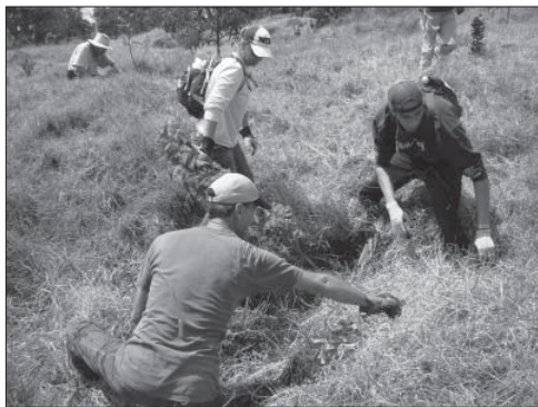
Clearing around native seedlings at Kahuku

Volunteers spent a pleasant day in March at the Kahuku unit of the park locating native plants and clearing vegetation around them as part of a project studying control methods of pasture grass, a vigorous plant competitor. That project is working with the University of Hawai'i Extension Service to improve grass removal methods.