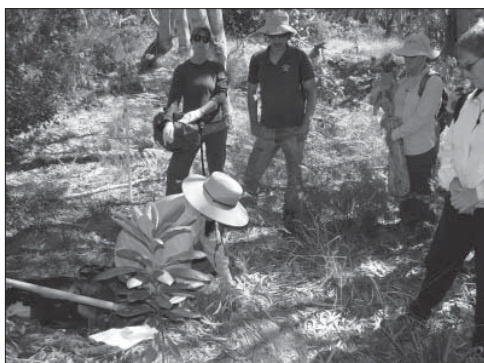
Demonstration of planting and mulching

In May there was a period of rain and we were able to help with one project to add native under-story species diversity in the koa forest on the Mauna Loa strip. We planted 348 'a'ali'i, hō'awa, and māmane.