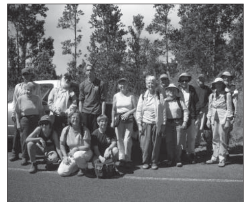
A tired but satisfied faya removal crew

We made three trips (February, April, and July) into the Keanakakoi Special Ecological Area to remove the highly invasive Morella faya . Since we had not worked in this area for two years, many trees had grown two to four or more inches in diameter. These faya required determined saw work from volunteers to cut down and treat with herbicide. During these three projects, we removed 1,563 faya, 43 blackberry, 31 strawberry guava, and three kahili ginger plants. Best of all, we have now finished sweeping the area. If we make it through the area every year or two, it will greatly assist the park crew in controlling the faya population.