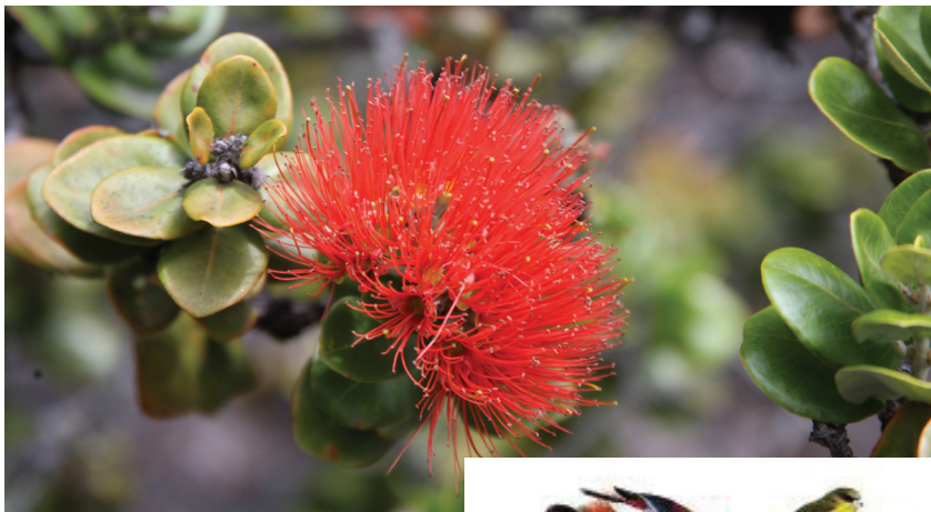
Pua lehua