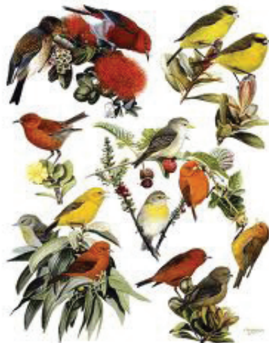
Native honey creepers.